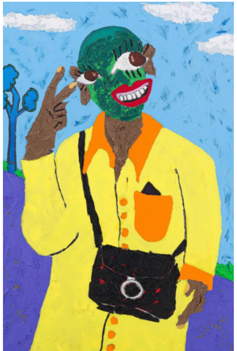
Artist: Lwando Dlamini